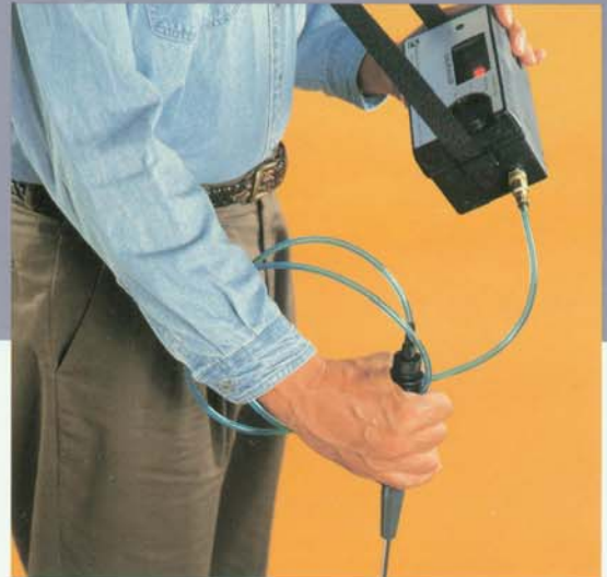
Gas-Ranger's high speed internal pump is ideal for leak classification.