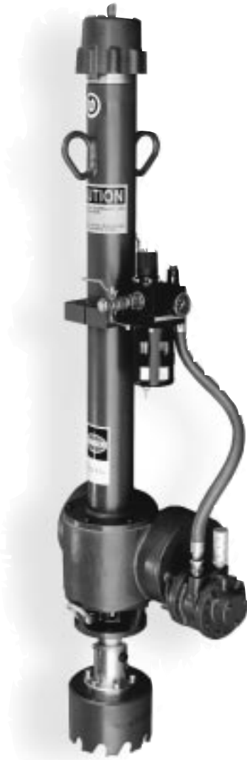
■ T203 Tapping Machine