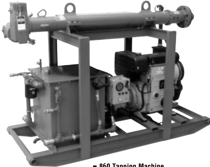
■ 860 Tapping Machine